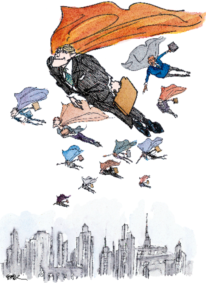
The current corporate dogma encourages star employees to make their own rules.

You have just been promoted to head of an important department in your organization. The previous head has been transferred to an equivalent position in a less important department. Your understanding of the reason for the move is that the performance of the department as a whole has been mediocre. There have not been any glaring deficiencies, just a perception of the department as so-so rather than very good. Your charge is to shape up the department. Results are expected quickly. Rate